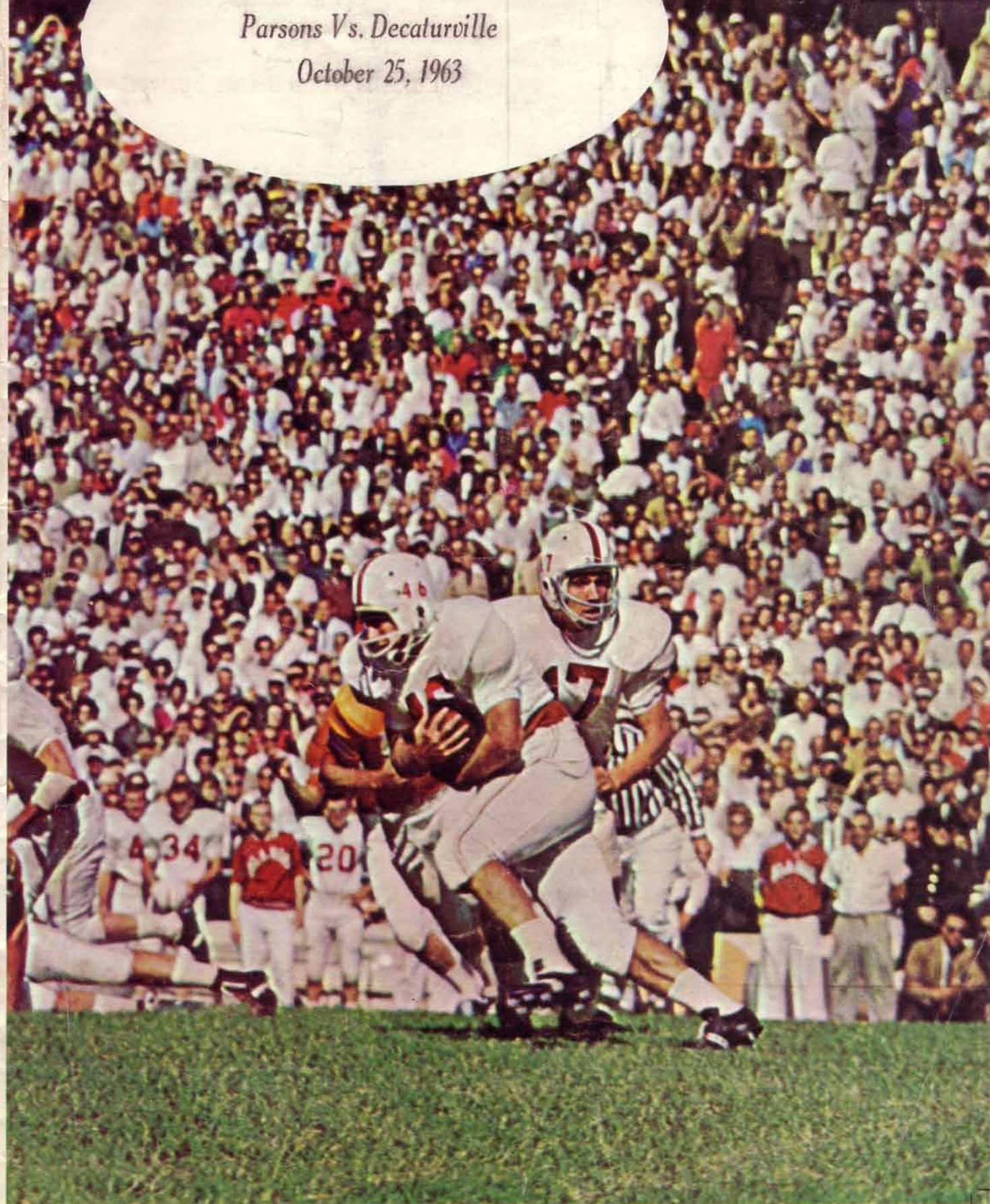
Parsons Vs. Decaturville October 25, 1963